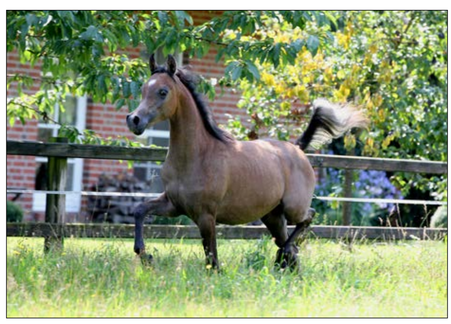
NK Houssain Al Dine