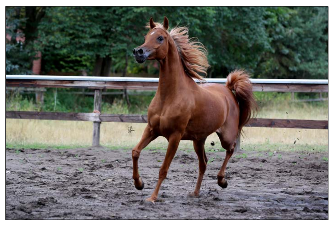
NK Bint Bint Nashua