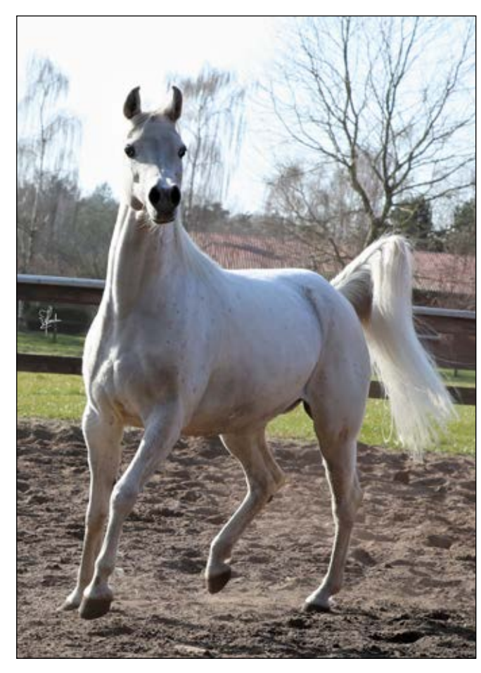
NK Naala NK Ninnifee

can be considered as one of the most impressive yearling fillies at this time. It is a delight to look to such a gracious Arabian.