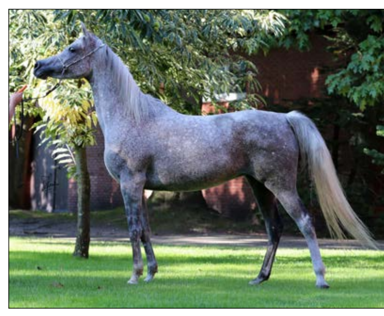
NK Nahla NK Habiba

yearling fillies. They were chosen from such families, which had proven to be very important and essential for the success of the El Zahraa Stud in the past. Four of these fillies became finally the root mares of the Katharinenhof stud.